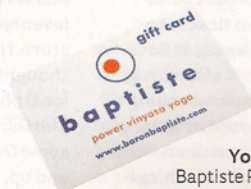
Yoga class, $14, Baptiste Power Yoga Institute