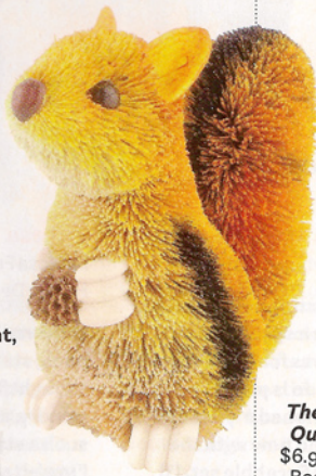
Brushkins squirrel ornament, $8, Nomad