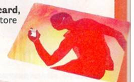
iTunes gift card, $15, Apple Store