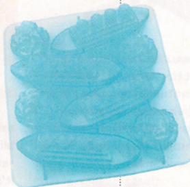
Gin & Tonic ice cube mold, $8, Davis Squared