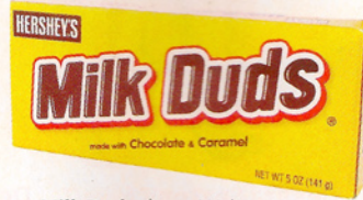
Milk Duds, $1.59, Walgreens