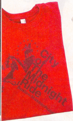
Graphic T-shirt, $12, Magpie

"I hit the Back Bay and Beacon Hill by car (without getting a single parking ticket!) and chose items that would make for a fun winter night in, whether you're hosting a group or just hanging out with one person."