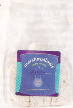
Vanilla marshmallows, $4.99, Whole Foods Market