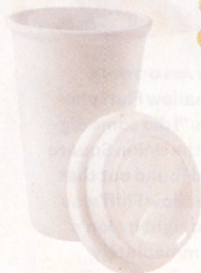
Ceramic coffee cup with silicone lid, $19, Greenward