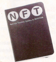
Not for Tourists Guide to Boston, $16.95, Black Ink