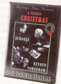
Classic Christmas DVD, $5.98, Trident Booksellers & Café