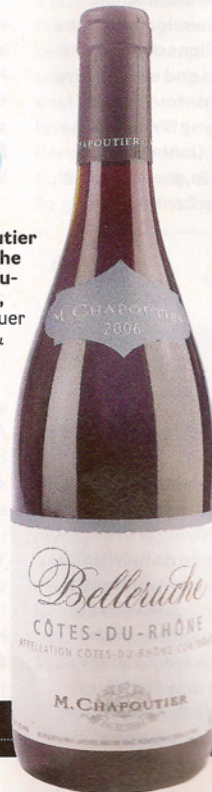
M. Chapoutier Belleruche Côtes-du-Rhône, $9.99, Bauer Wine & Spirits