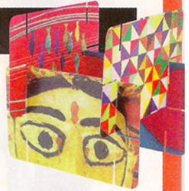
House of Cards (deck of interlocking picture cards), $25, Good