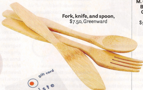
Fork, knife, and spoon, $7.50, Greenward