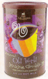
Hot chocolate, $8.99, Whole Foods Market